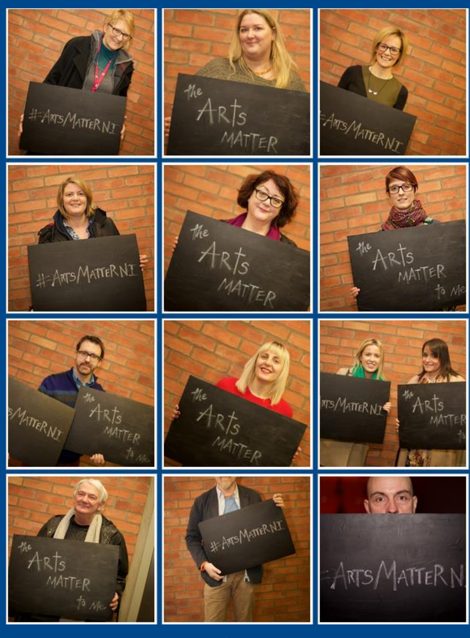
#ArtsMatterNI Campaign Toolkit

a campaign to save arts funding in NI #artsmatterNI